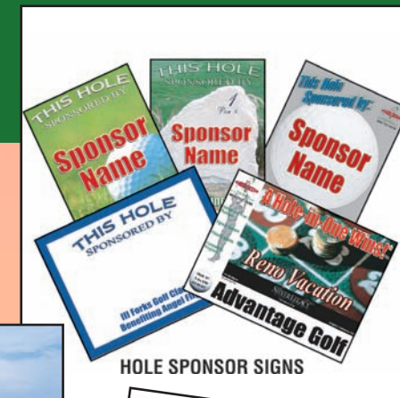
HOLE SPONSOR SIGNS

1-9 Plaques . . . . . $35.00 each 10-19 Plaques . . . . $27.50 each 20+ Plaques. . . . . $25.00 each